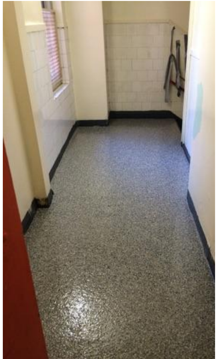
Same stairwell with finished system installed.