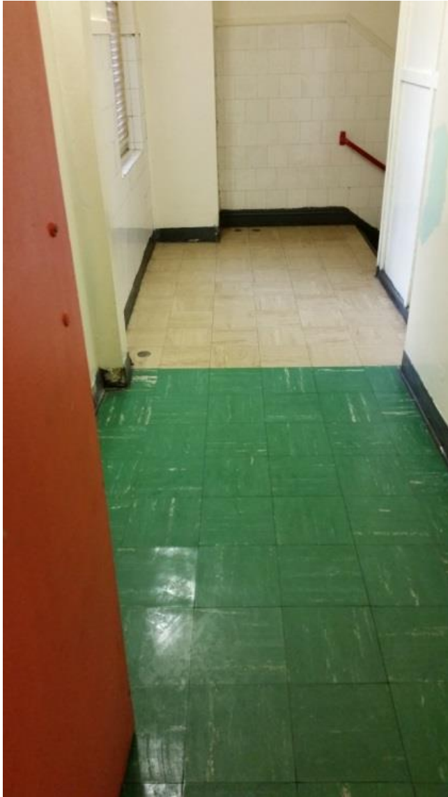
One of the stairwells before application.