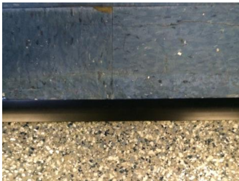
The classrooms were not part of this phase, so transition strips were installed to give a clean look.