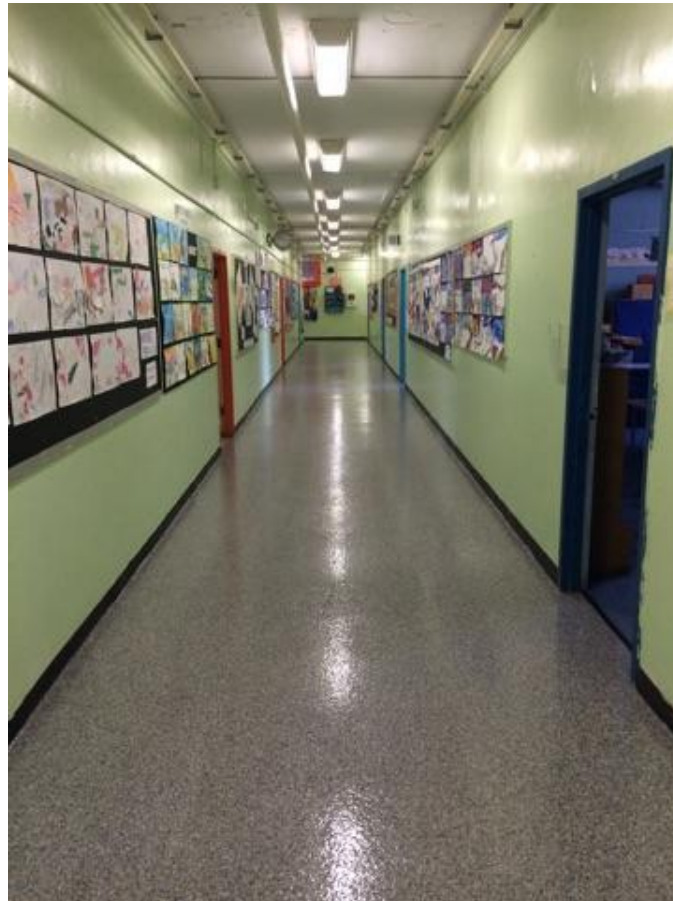
This is one of the hallways after system was installed.